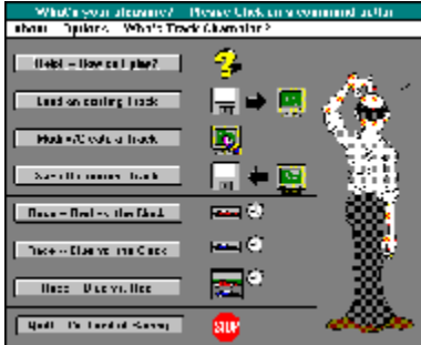
The 'Little Bald Man' control panel

(1) The 'Little Bald Man' form that always appears right after the 'splash' form. This is the main control form for Race Track and where you switch from Track Build mode, Racing mode, Save a Track, Load a Track, etc. -- it is the control hub of Race Track. You probably got to this help file by clicking on the help command button on this form.